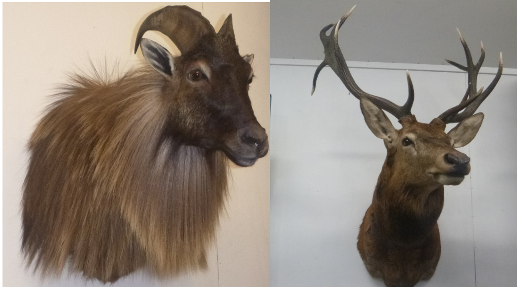
Examples of recent mounts

Please look at their Website for details: