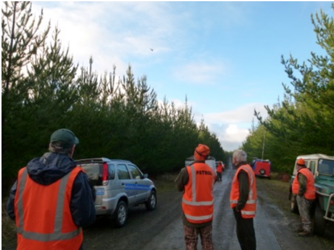
Search and Rescue Command base Inland Road