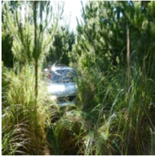
A tight spot block boundary marking