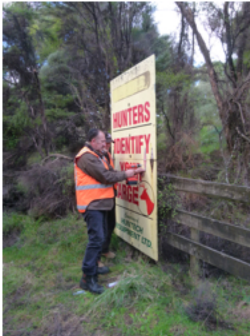
Attaching new hinges to hunter safety sign