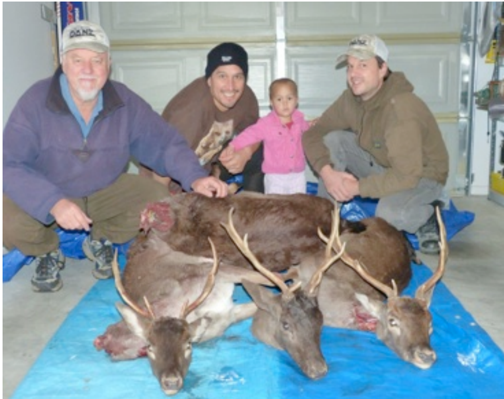
3 happy hunters & the upcoming generation.

he took this opportunity. It was very dark before we had the animals back to the vehicle & started the drive for Hamilton. Three happy hunters. In all, we had seen over 30 animals including another good pig which SJ saw from the car park.