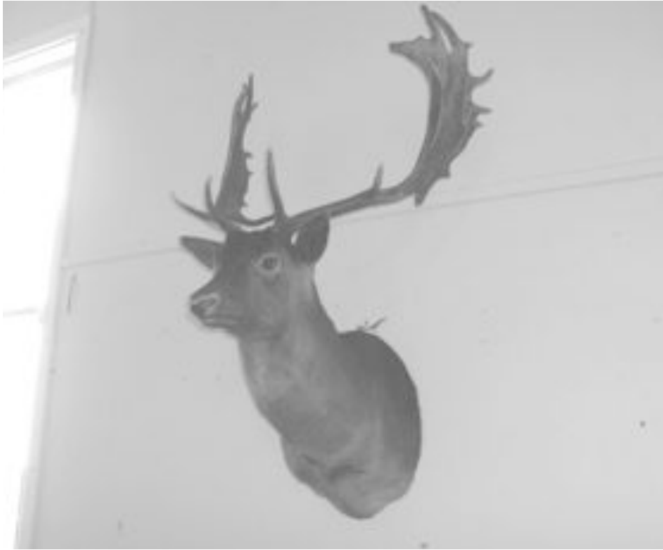
A Classic buck