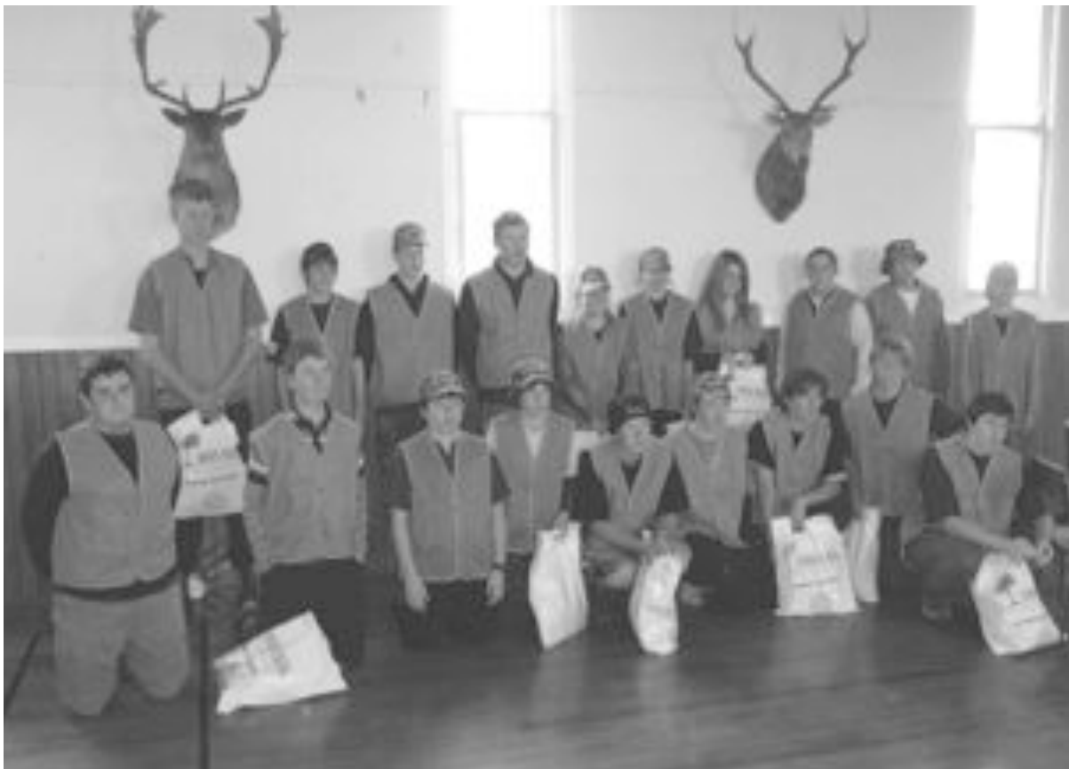
Kids at the Southhead Hall with sponsors' kits