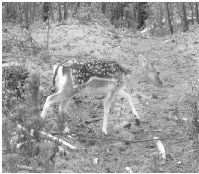
(On walkabout)