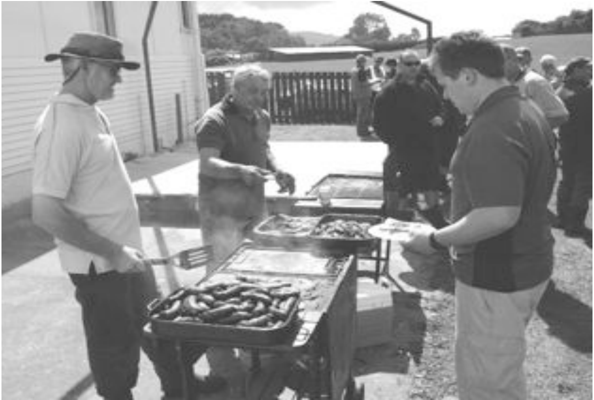
BBQ at Take A Kid Hunting day