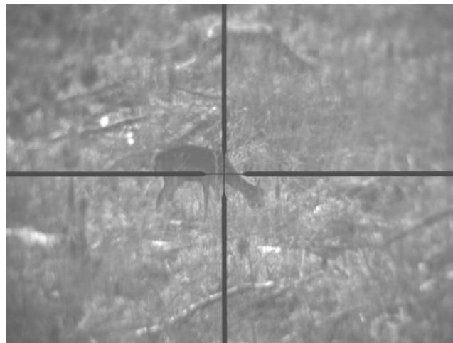
Deer in sight